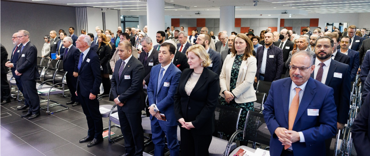
Minute of Mourning

At the opening of the Forum, tribute was also paid to the current situation in the region with a minute of mourning for the numerous civilian victims, children and women, and a strong appeal for peace in the Holy Land.