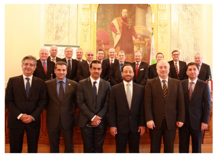
AACC Board of Directors

On 28 November 2014, the Austro-Arab Chamber of Commerce invited Their Excellencies the Arab Ambassadors and Arab Diplomatic Corps, together with the AACC's board of directors and members to attend the chamber's 23<sup>rd</sup> General Assembly, together with the 24<sup>th</sup> Meeting of the Board of Directors at the "House of Trade" in Vienna.