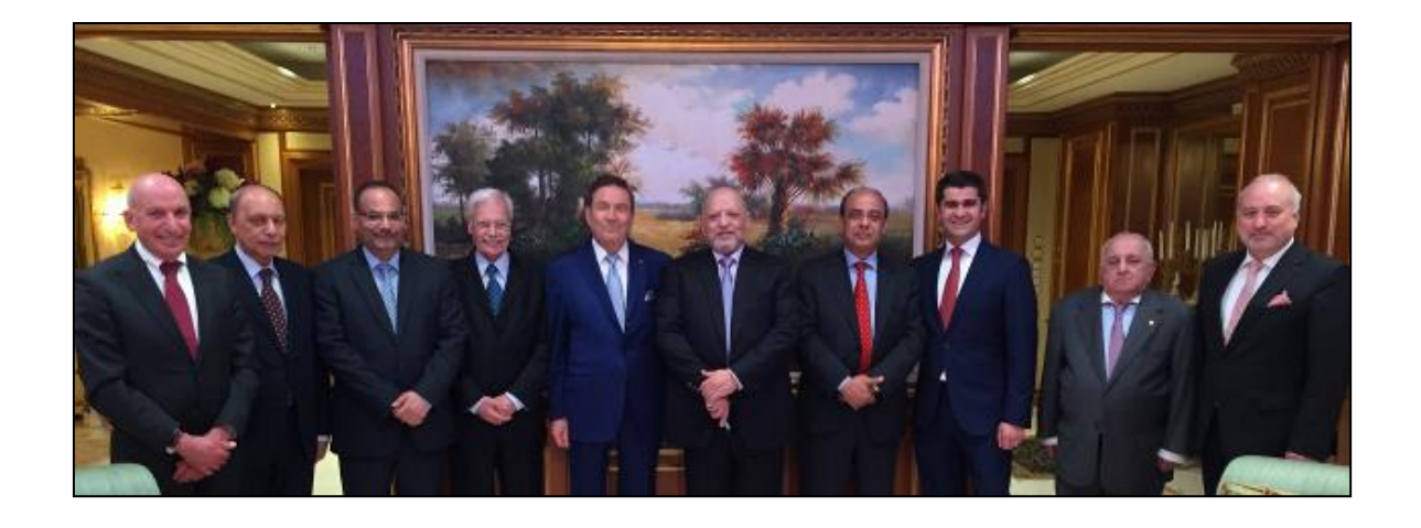
12-14 March 2015: AACC participates in the international Crans Montana Forum in Morocco